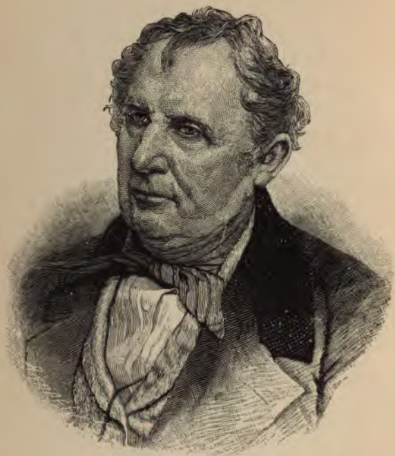
J. Fenimore Cooper